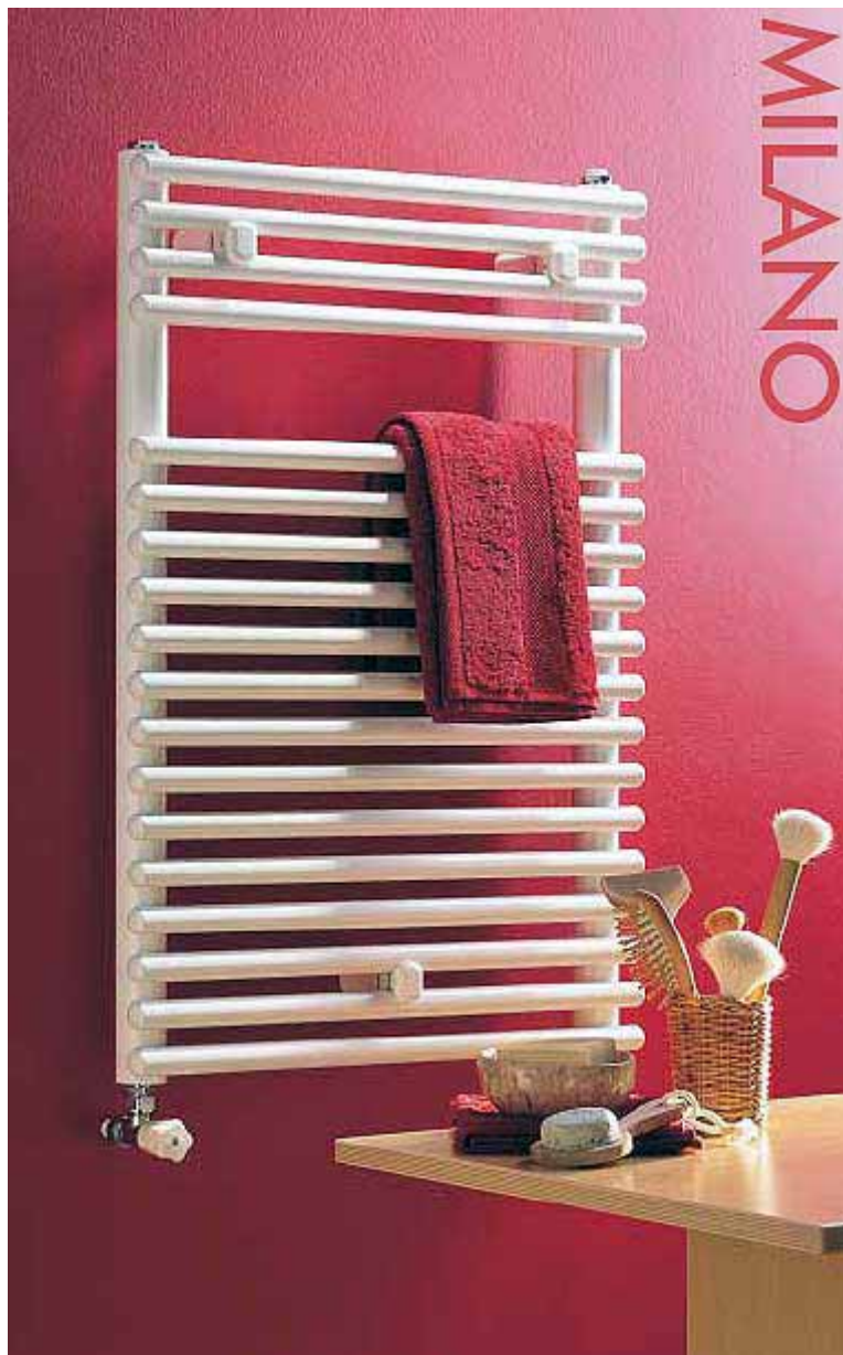
Milano 1479H X 500W White Flat Towel Warmer