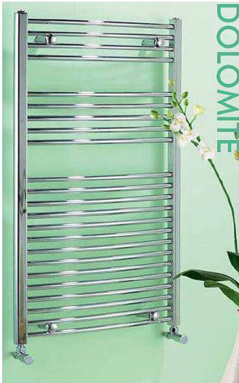
Dolomite Italian Chrome Curved Heated Towel Radiator 1100mm X 500mm