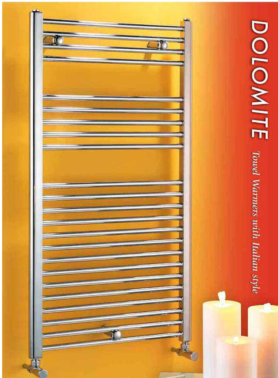
DOLOMITE 800H X 500W High Efficiency Italian Chrome Flat Towel Heater